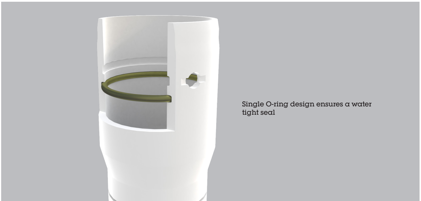
Single O-ring design ensures a water tight seal