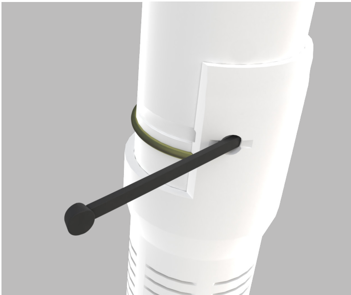
Button Spline design allows for easy insertion and is recessed into the joint - no need to cut excess spline