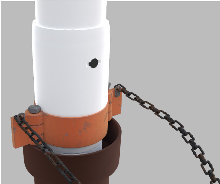
Standard bell end allows for traditional elevators to be used