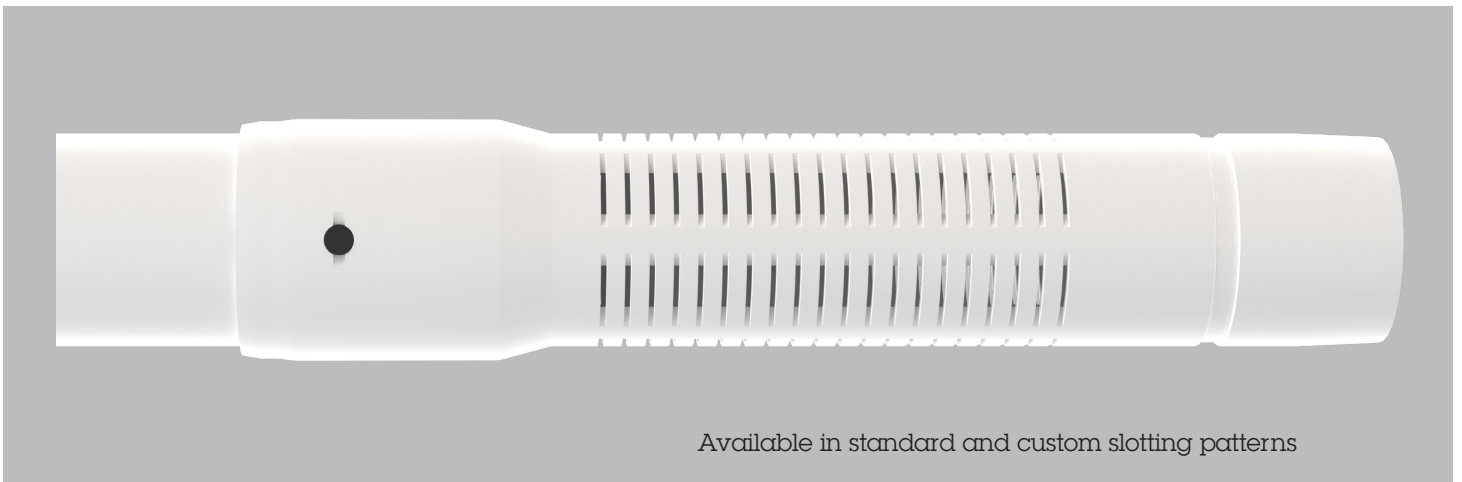
Available in standard and custom slotting patterns